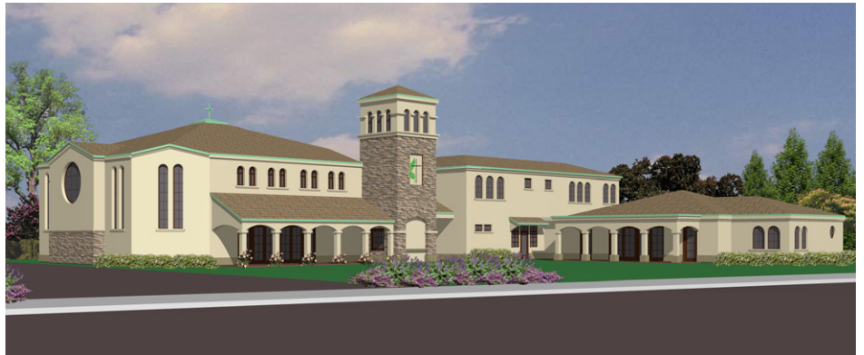
2091 17th Avenue, Santa Cruz, CA 95062

The United Methodist Church of Santa Cruz has been given the opportunity to develop a new facility at 2091 17th Avenue in the Live Oak neighborhood of Santa Cruz County. The intent of the trustees, congregation and stakeholders is to follow the U.S. Green Building Council's LEED for new construction certification program and to achieve the highest possible rating of Platinum.